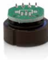
▶ SPS 1000 Z